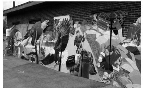
Mystic River Mural panels on display (David Fichter, muralist).