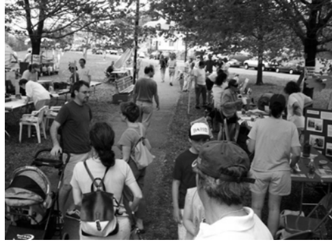
Festival crowd.