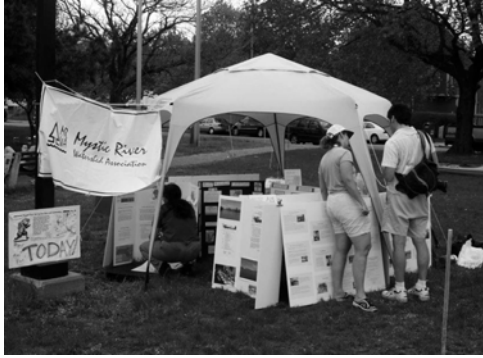
MyRWA tent.