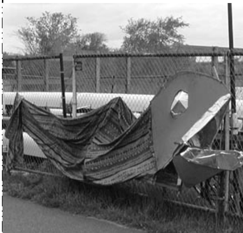
Big Bass Puppet.