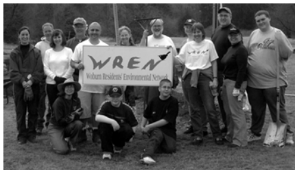
WREN at work.

WREN has grown from a handful of people meeting on the "Woburn Chat" three years ago to a recognized and respected group in the community. People now come to