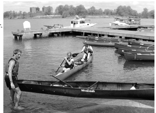
Canoe and Kayak rides on the Mystic.