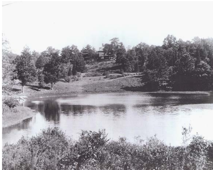
Brooks Pond c. 1885, with house designed by Peabody and Stearns in background.

Since its inception in 1997, M-BELT has been working to develop a high-quality master plan for the