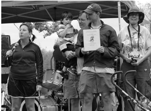
Chelsea Creek Action Group - leadership award ceremony.