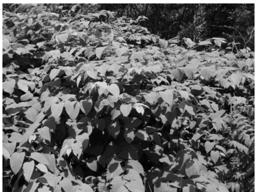
Japanese knotweed, along the Mystic, in Somerville.

The Arlington Bicycle Advisory Committee, Green Streets & Friends of Spy Pond Park, and Arlington Land Stewards will be doing trail cleanup to control the spread of Japanese knotweed along the Minuteman Trail in Arlington on the following Saturdays: July 24 th , Aug 14 th , Aug 28 th . 10am- 1pm. Contact for specific meeting place along the Minuteman Trail. People are welcome to help anytime during that time period. If you have work gloves, clippers, loppers, and similar gardening tools, please bring them. Info: email: kernanen@earthlink.net or http://www.abac.arlington.ma.us/Pages/projects.html