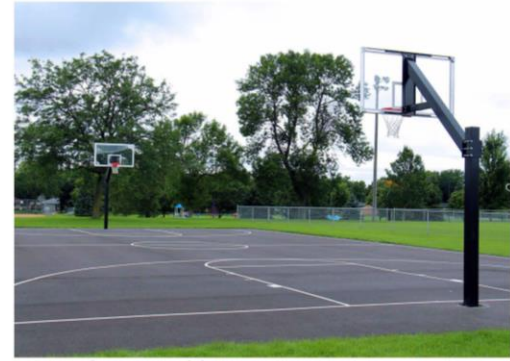
FULL BASKETBALL COURT