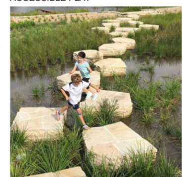
WETLAND EXPLORATION STONES