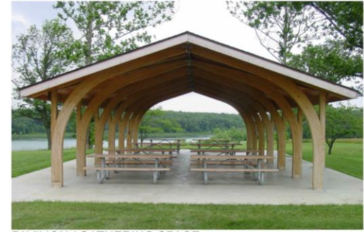
PAVILION / GATHERING SPACE